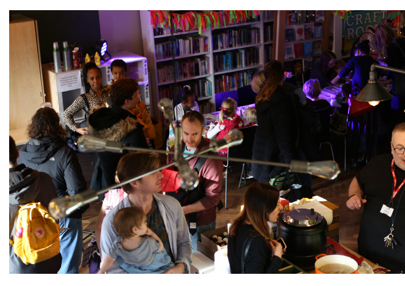
Live music in the library

UNLH's vision is to be a centre for lifelong opportunity and possibility. Everything we do is geared towards making us a central hub for local residents to access services they need and want. As part of this, we have been working very hard to become self-sustainable so we can protect and assure the future of the library service, the building and all the other services we provide. Pre-Covid 19 nearly 50% of overall income was earned from trading activities driven by a diversified business model.