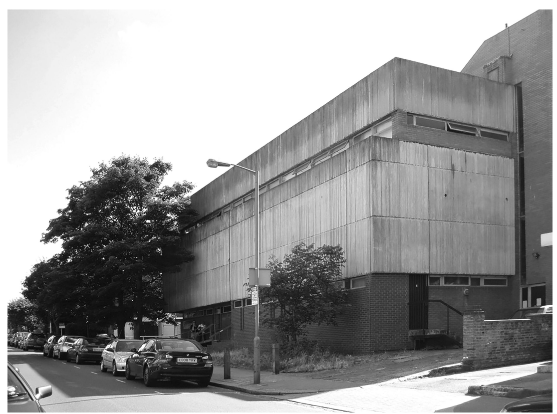
The Devas club in Battersea where CREW will be installing community-funded heatpumps