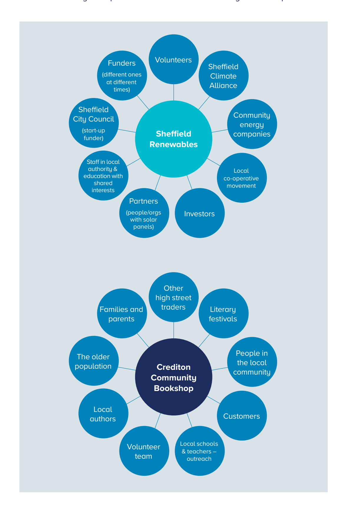
Box 2: Case study examples – stakeholder and community relationships

to which three of the case study businesses felt they were accountable. These illustrations are not definitive but a means to represent a complicated picture.